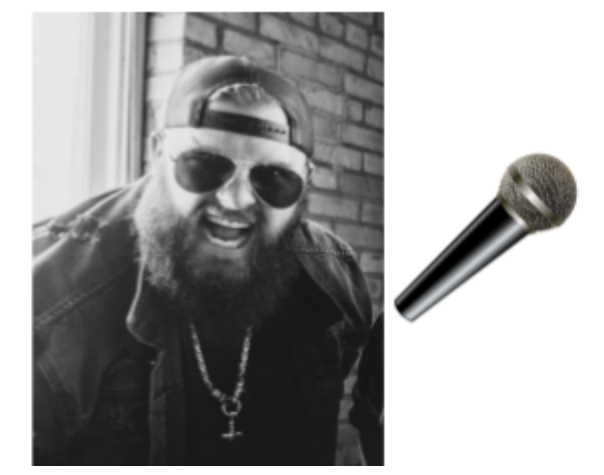
Garrett Guitar Backup Vocals Wireless In Ears